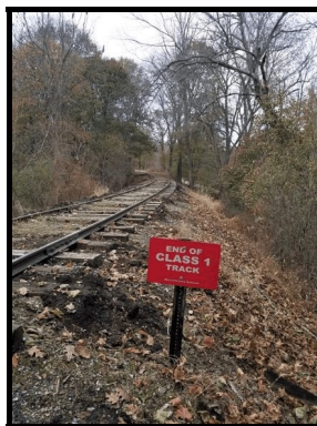
Moving the "End of Class 1 Track" sign to the west of the Iron Bridge Road grade crossing, indicating the extension of the "big train" track.