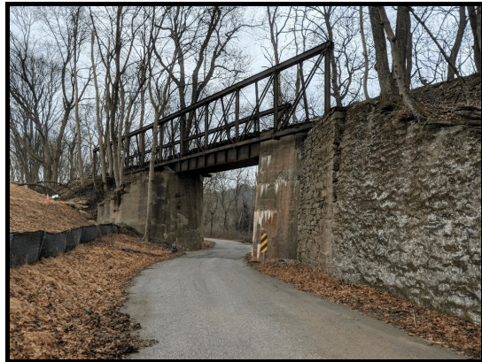
The iron bridge looking south along Valley Road after restoration work was completed. To the left you can see the temporary sediment control barriers installed by a contractor who is building a housing development on a former farm.