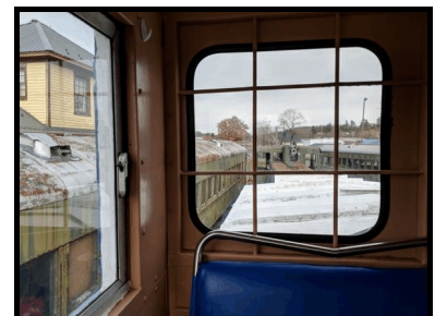
Seeing a bit more clearly now through one of the replaced windows in the blue caboose!

Dedicated to Preserving the Stewartstown Railroad—An Authentic American Antiquity