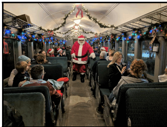
Santa visits with the passengers on one of the Stewartstown Railroad’s “Santa” trains in December 2019.

We are currently looking for an individual to go out in the community and spread word of the Friends’ preservation and restoration efforts of the Stewartstown Railroad. Duties