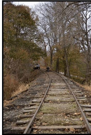
A work train in the distance along the Stewartstown Railroad's right-of-way near the iron bridge.