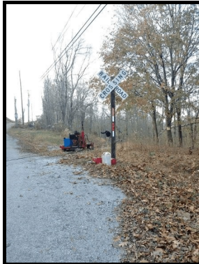
Trackwork begins west of the Iron Bridge Road grade crossing.