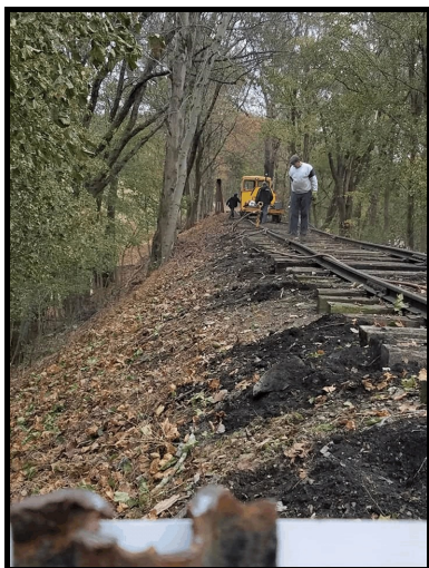
Track crew working on the track just west of the iron bridge.