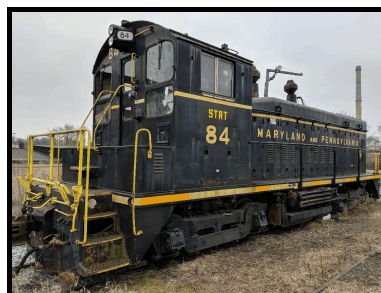
The Friends locomotive, former Ma & Pa #84, rests in its storage location in York, PA.