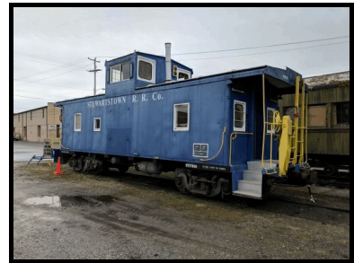
The railroad's former Union Pacific caboose received some attention, too. Some of the "fogged" windows received new clear glass.