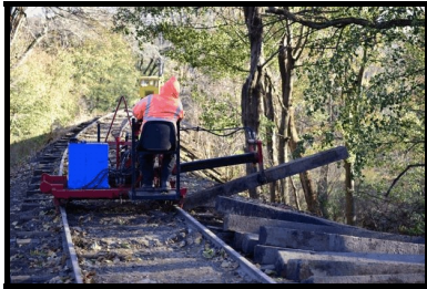
Crosstie replacement underway near the iron bridge.

The fourth quarter of 2019 was a busy time on the railroad. In the spirit of "a picture is worth a thousand words" here's a sample of our volunteer's efforts as 2019 came to a close.