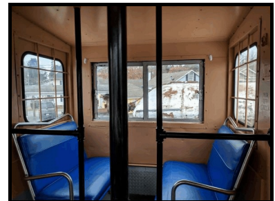
Windows in the railroad's blue caboose received new clear glass.