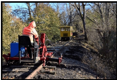
Trackwork underway using mechanical equipment.