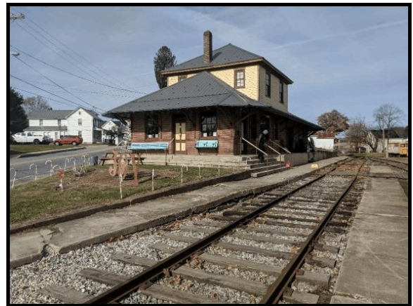
December 2019: The Stewartstown Railroad station appears to rest while the Santa train is out on the line. Note the Christmas decorations in the front yard, where the huge maple tree once stood. The approximately 106-year-old tree needed to be removed as it had become a safety hazard due to its shedding of some sizable limbs with every passing storm.

We are also working to determine how best to repair the missing window track, replacing steel between windows and sill plate. John Watson is currently working on preparing the first set of new windows to install once the window edge steel repairs are made.