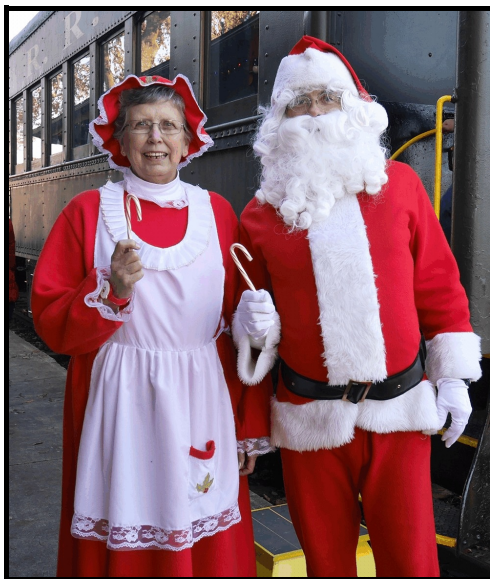
Santa and Mrs. Claus prepare to board the Stewartstown Railroad's Santa train.