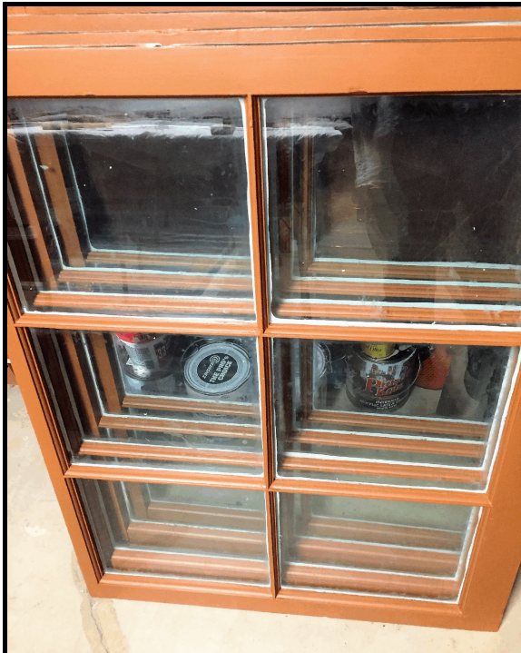
The windows for the second floor of the station in Stewartstown have been repaired/rebuilt and reglazed and are ready for installation on the station.