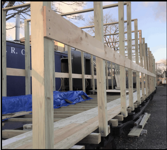
In this photograph the Friends flatcar is fully-framed for its conversion to an open-air observation car.