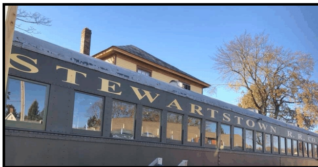
Close-up view of the new lettering on coach #1341.

The final four upstairs windows are being repaired. The windows to the former board room have been finished and replaced. In the spring, rotted boards around the upstairs windows will be replaced. We are currently working on grant applications for side walk and roof replacement.