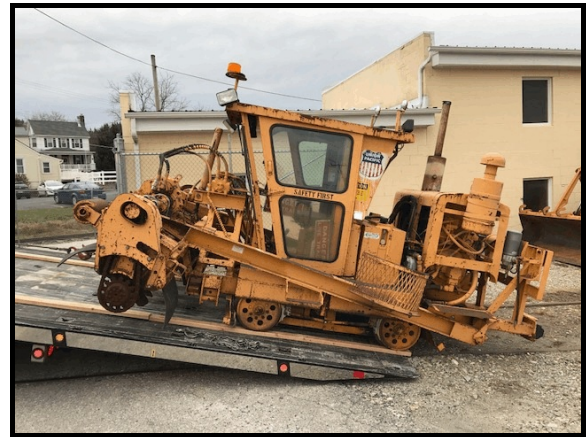
The scarifier arrives in the Stewartstown Railroad's yard.'

We hope to see you out on the line, helping us make the Stewartstown Railroad better than ever!