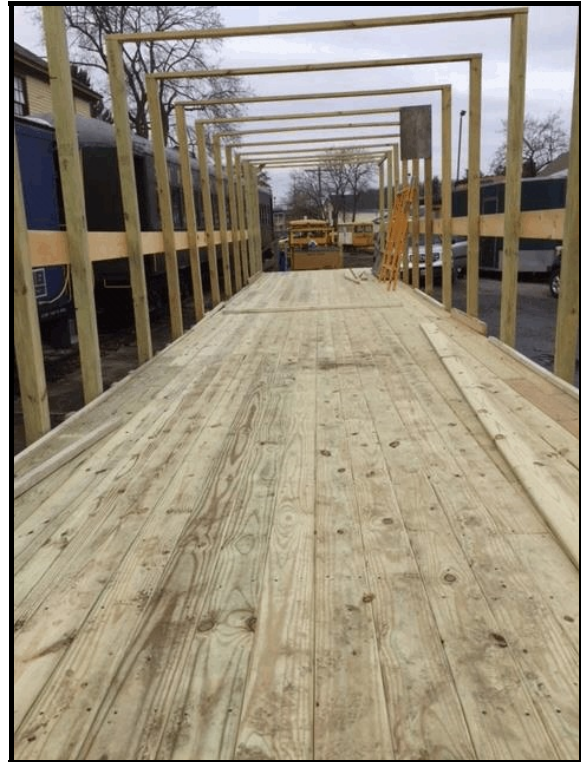
By late December the installation of the flatcar deck had begun and was completed in early January 2018.