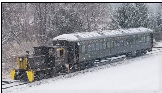
One of the Stewartstown Railroad's 2017 Santa trains passing the Bailey Springs neighborhood in a snow storm.

We are assisting the railroad with former Reading Company coach #1158. Friends' members are creating 14 new windows to replace ones that are missing, broken, or unsafe to use.